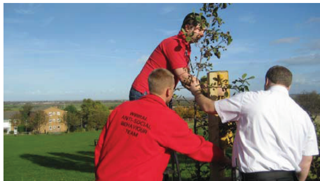
Grange Park, West Kirby

The Grange Park area of West Kirby saw environmental improvements led by the Friends of Grange Park residents' group with the planting of cherry trees and a lantern making workshop with children and young people. Tower Grounds in New Brighton saw local residents lead on an environmental audit with agencies. Work was undertaken in partnership with Leasowe Community Homes, taking the opportunity to speak with residents and young people attending the annual 'Unity in our Community' Halloween fancy dress party.